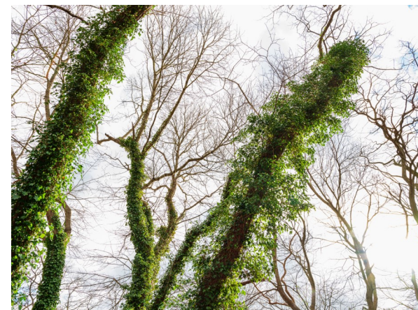
English Ivy damaging trees

http://www.ncsu.edu/goingnative/howto/mapping/