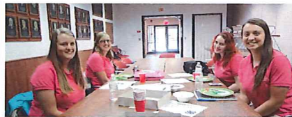
West District 4-H Officer Team - Planning the March 28-29 Teen Leadership Retreat