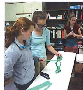
Horse Club members in a Team Building Game